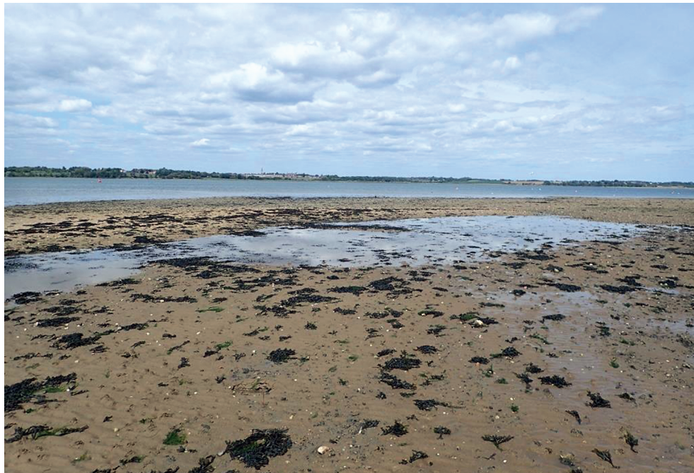
Figure 1 Wrabness Haminoea navicula habitat.